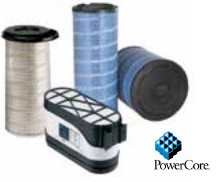
Replacement filters deliver better protection for heavy-duty off-road equipment with Donaldson Endurance™ filters or PowerCore® filtration technology.