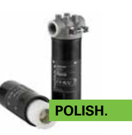
High pressure filters are specially designed for pointof-use applications on the outlet side.