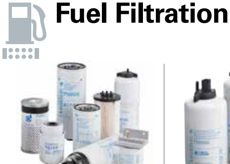
Fuel filters Donaldson provides filtration solutions that protect engine components and help extend equipment life.