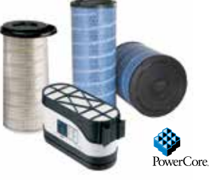
Replacement filters Donaldson delivers better protection for heavy-duty off-road equipment with Donaldson Endurance™ filters or PowerCore® filtration technology.