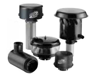
Pre-cleaners extend air cleaner life by preventing larger particles from reaching the filter. The TopSpin HD<sup>®</sup> is designed for the rugged mining conditions.