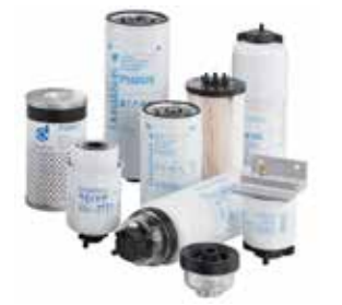
Fuel filters Donaldson provides filtration solutions that protect engine components and help extend equipment life.

Donaldson filters help prevent premature pump wear and injector clogging by delivering clean fuel to your engine. They're a better way to filter fuel.