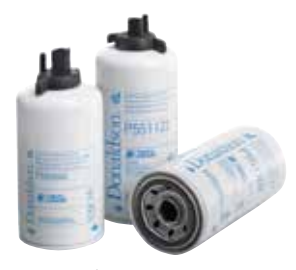
Cummins<sup>®</sup> engines Twist&Drain<sup>™</sup> filters with integrated WIF sensors simplify the complicated task of removing water.