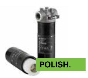
High pressure filters are specially designed for point-of-use applications on the outlet side.