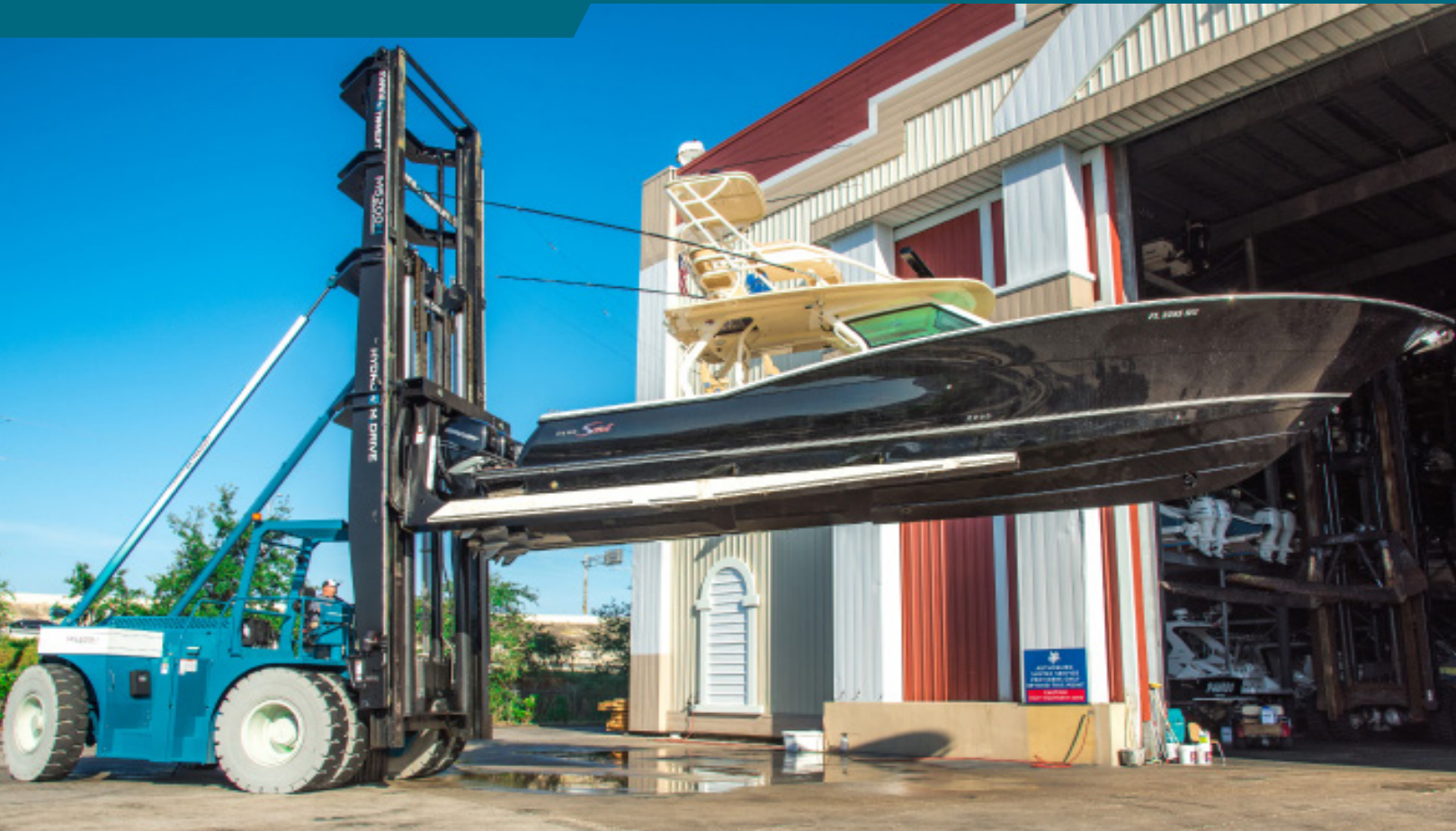
M5200H - Florida, USA

Marinas and boat yards are proving grounds for efficiency and durability.