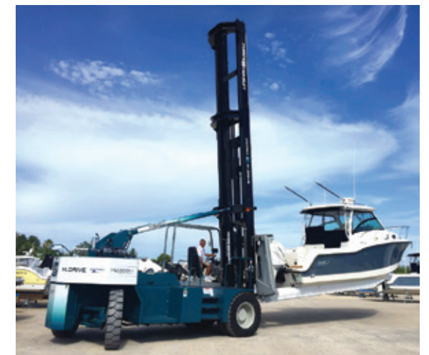
M2800H - Sarasota, Florida