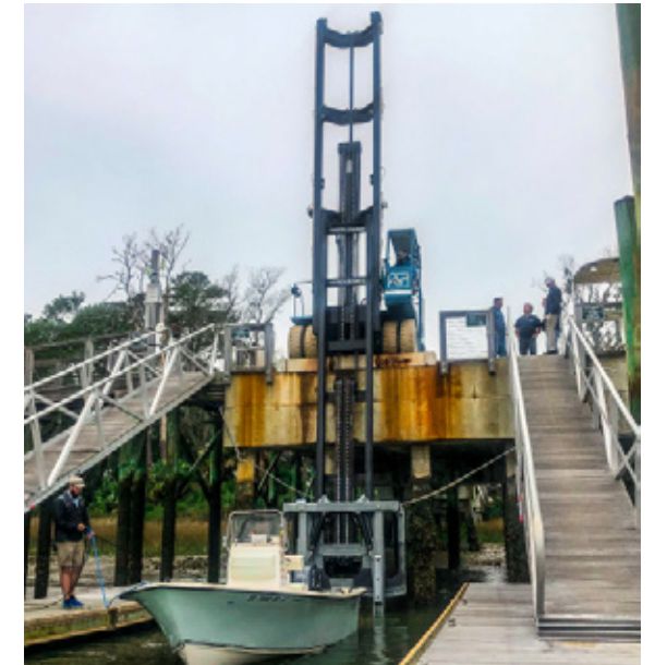
M2300H - Palmetto Bluff, North Carolina