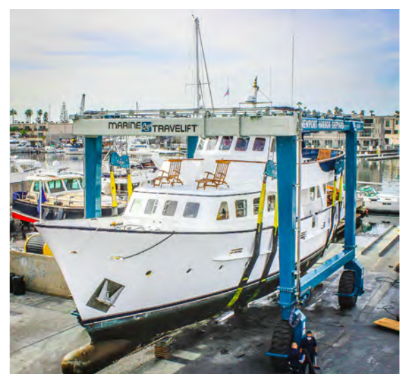
85 BFMII - California, USA