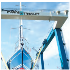
TOP BEAM EXTENSION

Hoists are available in custom sizes to meet the requirements of your yard.