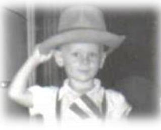
#15 Forth Worth