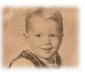
#2 Fort Lauderdale