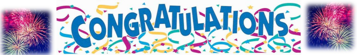
Service Operations Manager