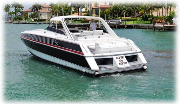
Never Say Never