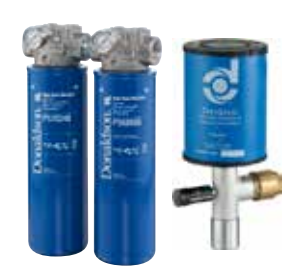
Clean & Dry Kit includes single head (2), high efficiency diesel filter, water absorbing filter, pressure gauge (2) and T.R.A.P.<sup>TM</sup> breather.