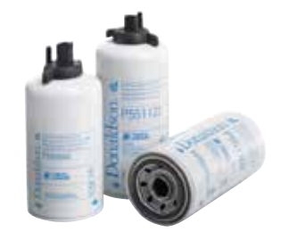
Cummins® engines Twist&Drain™ filters with integrated WIF sensors simplify the complicated task of removing water.

Cummins® is a registered trademark of Cummins Inc. Racor® is a registered trademark of Parker Hannifin Corporation