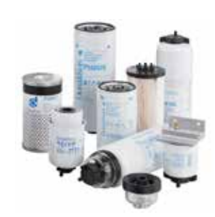
Fuel filters protect engine components and help extend equipment life.

Donaldson fuel filters help keep your engines and equipment running smoothly. They're a better way to filter fuel.