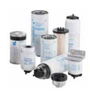
Fuel filters protect engine components and help extend equipment life.

Donaldson fuel filters help keep your engines and equipment running smoothly. They're a better way to filter fuel.