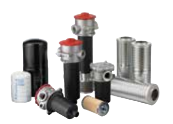
Low Pressure filters rated for working pressures up to 350 psi, spin-on, in-tank and in-line configurations.