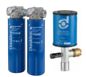
Clean & Dry Kit includes single head (2), high efficiency diesel filter, water absorbing filter, pressure gauge (2) and T.R.A.P™ breather.