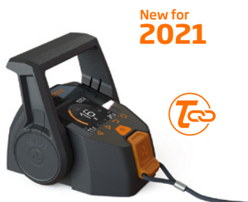
TorqLink throttle with colour display