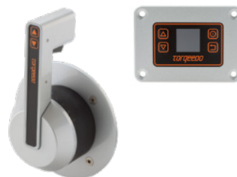
Side-mount motor and display