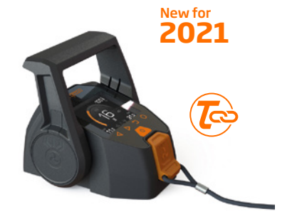
TorqLink throttle with colour display