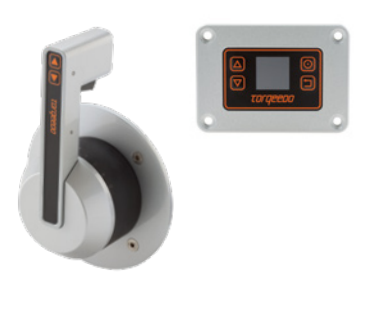
Side-mount motor and display