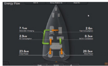
Energy flow: Understand your system's power balance & energy flow at a glance.