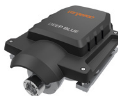
Deep Blue 25/50 i

This 100 kW motor was specifically constructed to power fast, planing motorboats. With a reliable, low-maintenance, direct-drive design, the Deep Blue 100i delivers extraordinary performance, with up to 2,700 RPM and a torque of 437 Nm.