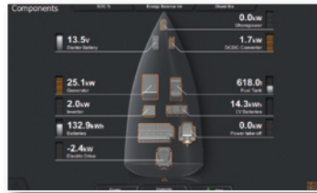
System management: Provides status data on all system components.