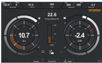
Drive screen: All important information needed while motoring. You can choose to display or hide the information line at the top.