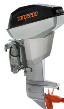
Deep Blue 25/50 R