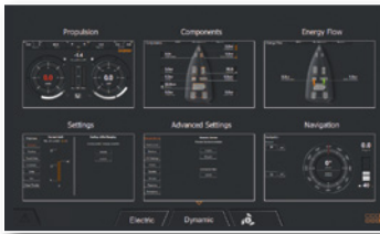
Main menu: Navigate easily between different categories.

This integrated, modular system provides comprehensive energy management for larger vessels or those with complex energy requirements. Each component's energy demands are monitored and managed by the central system, ensuring economical collection and distribution of renewable energy with automatic generator backup.