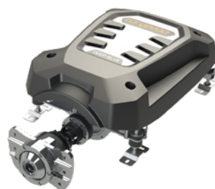
Deep Blue 100 i