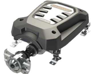
Deep Blue 100 i