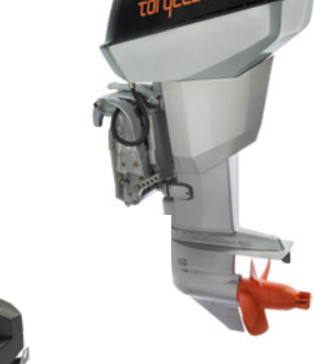
Deep Blue 25/50 R