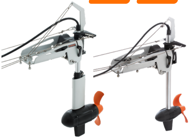
Ultralight 1103 AC

Professional kayak anglers don't hit the water without their Ultralight, and neither should you. With the Ultralight 1103 AC, you can beat the crowd and get to that coveted spot more than 30% faster. The whisper-quiet, direct-drive Ultralight 1103 AC comes with the innovative angler mount and all the high-tech features you've come to expect: GPS built in, real-time range and runtime display, solar charging, superior safety and performance, and the latest lithium battery technology. The 1103 AC is almost three times more powerful than the Ultralight 403 for the ultimate in acceleration and pulling power, and adds instant throttle response for improved manoeuvrability and a heavy-duty construction with more resistance to impact damage.