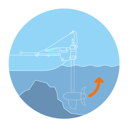
No problem with obstacles: The mount allows the motor to kick up toward the stern of the kayak when it encounters an underwater obstacle, thus minimising damage.