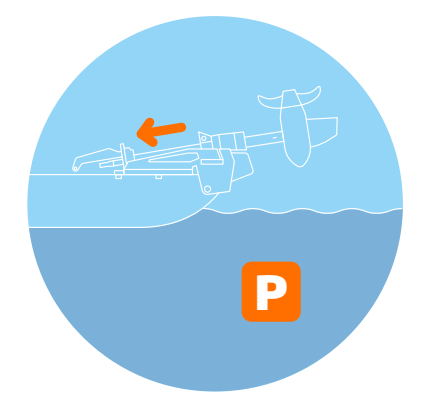
Handy park position: Safely stowing the Ultralight 403 for transport is quick and easy. Simply pull up and secure with the included elastic cord. To transport the Ultralight 1103, use the quick-release to remove the motor and stow.